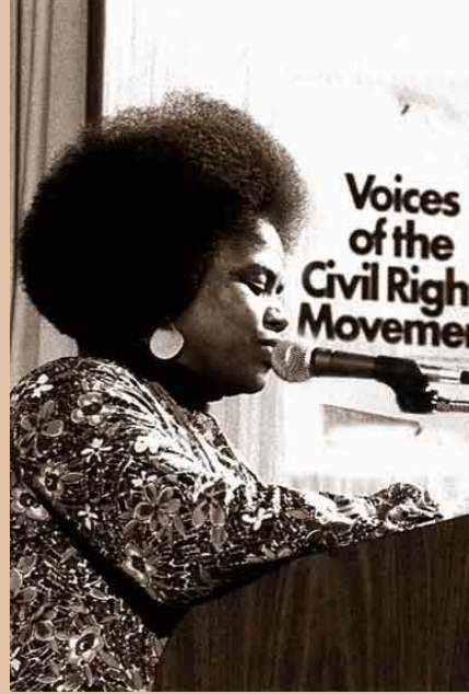
Bernice Johnson Reagon, 1960s